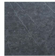
Pietra Dark Grey