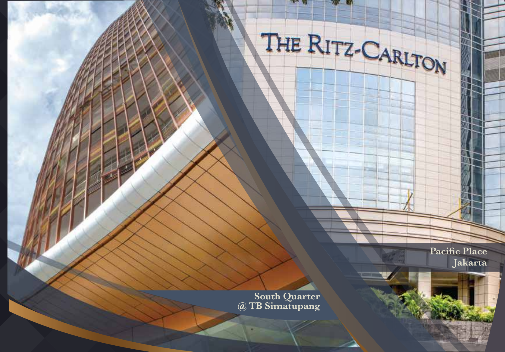
South Quarter @ TB Simatupang

* Written Warranty certificates will be issued for every necessary project based on the specifications of panels and color coatings used plus the environmental conditions. Certain colors due to raw material composition would have longer or shorter warranted life span.