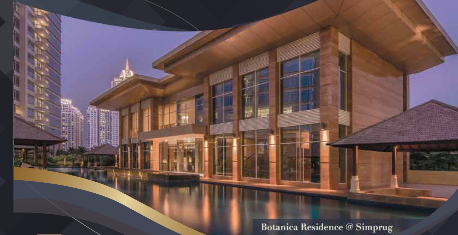
Botanica Residence @ Simprug